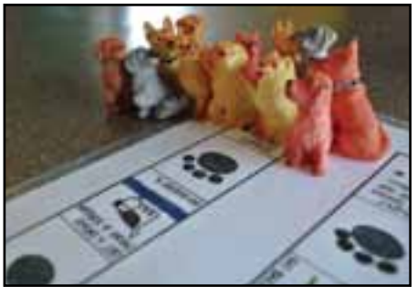
The Little Lost Dog Game