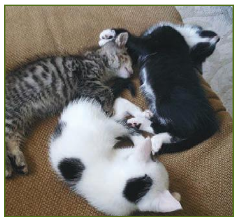
Fostering kittens is life affirming and life saving

Figuring out what makes some animals tick often takes a little detective work. There are the obvious clues that jump right out at you, but sometimes further investigation is necessary to decipher exactly what may be going on. And because the shelter is an artificial