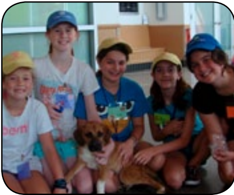
Attending Camp Happy Tails at the Potter League

This December saw a successful run of our first ever December Staycation Camp! This three day long mini-camp was offered in half day sessions during December school vacation. Although the week was shortened, the days were no less fun! Each day included educational activities, fun animal-themed games and crafts, and of course, the opportunity to meet and interact with some of the animals waiting for homes at our shelter.