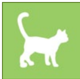
GREEN - Leader