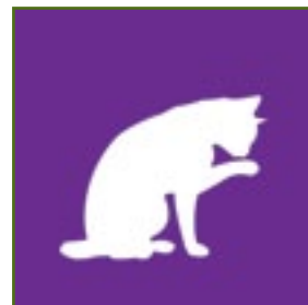
PURPLE - Lovebug

Stop by the Potter League and Meet Your Match or log on to www.PotterLeague.org for additional information.