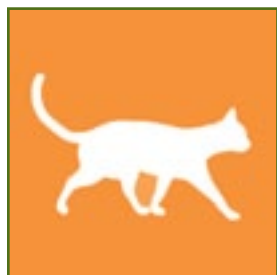
ORANGE - Sidekick

The resulting score of the assessment assigns a personality color of green, orange or purple. A kennel card with the assigned color is placed along with the cat's information for viewing. There are nine feline-ality categories. The purple category includes private investigator, secret admirer, love bug; Orange category has the executive, sidekick, personal assistant, and the MVP, party animal and leader of the band are in the green category.