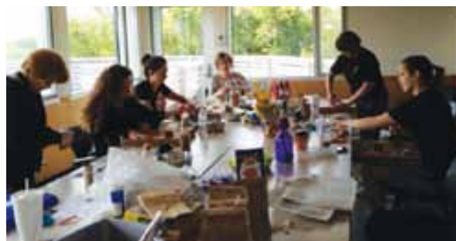
The Potter League Staff help out with making enrichment items for the dogs and cats that are currently at the shelter

Much like dogs, bunnies, guinea pigs and birds love to de-stress with their natural behavior of chewing. Empty toilet paper rolls make great chew toys for small mammals.