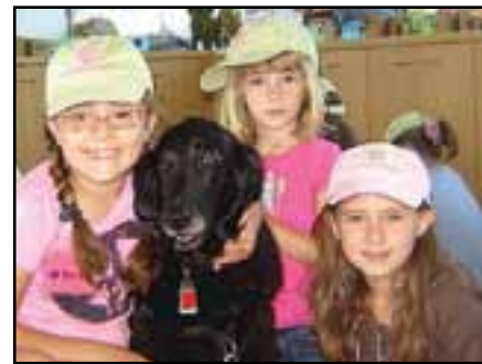
Camp Happy Tails at the Potter League

Camp Happy Tails introduces kids to the wonders and wows of the animal kingdom while learning compassion and respect for the world around them. Our hands-on educational programs allow kids to explore behind the scenes at the Potter League and unleashes a love for making a difference in animals' lives.