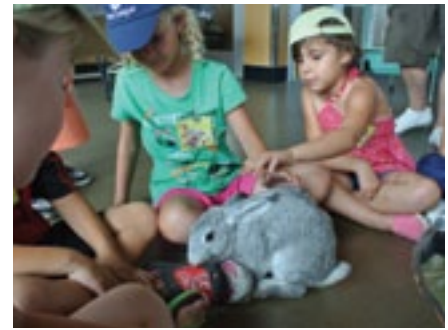
Campers have an opportunity to interact with animals waiting for adoption

Camp Happy Tails introduces kids to the wonders and wows of the animal kingdom while learning compassion and respect for the world around them. Our hands-on educational programs allow kids to explore behind the scenes at the Potter League and unleash a love for making a difference in animals' lives.