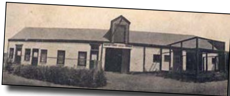
15 Harrington Street, Newport - 1931