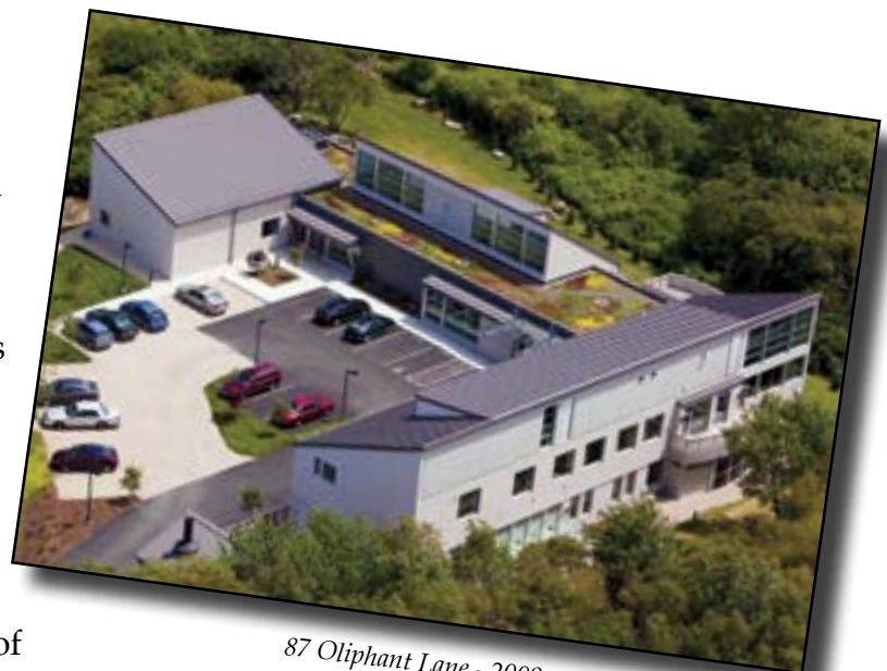
87 Oliphant Lane - 2009