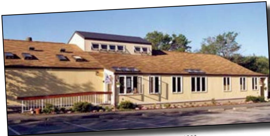
87 Oliphant Lane, Middletown - 1988

be renamed in memory of her husband. The Board of Directors of the Newport County League for Animals officially changed its name to the Robert Potter League for Animals on September 14, 1959.