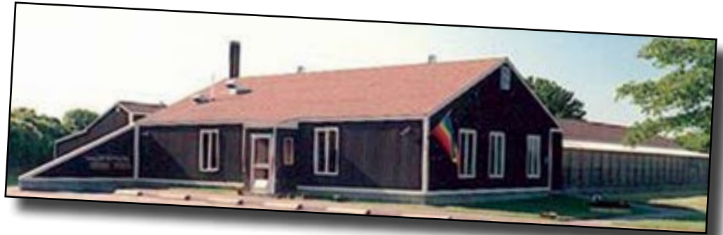
87 Oliphant Lane, Middletown - 1978