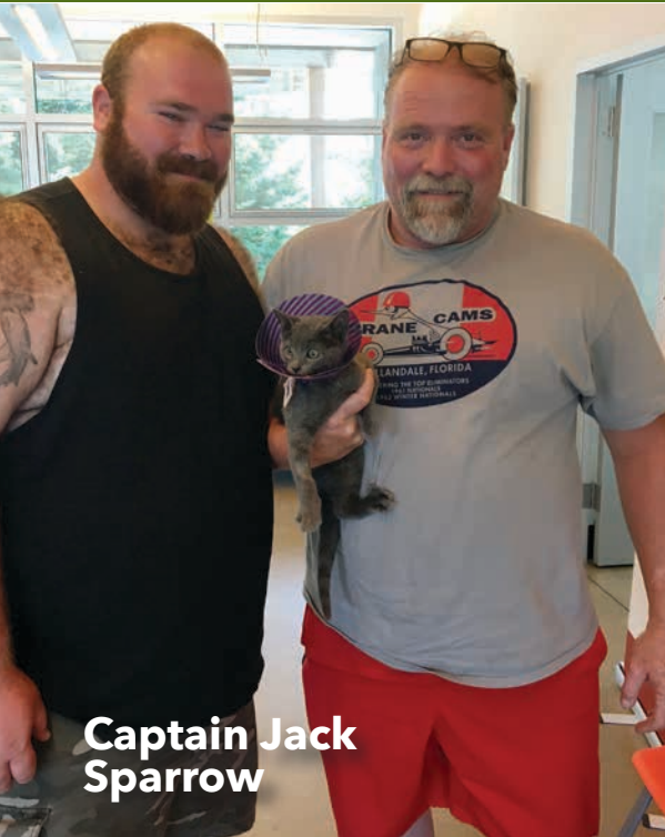
Captain Jack Sparrow