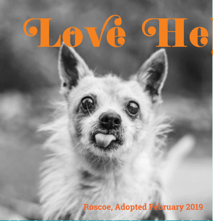
Roscoe, Adopted February 2019

Small, fragile, and suffering. Roscoe was at least twelve years old when he arrived at the Potter League. This sweet dog was so full of life and spunk, but he was in immense pain. He had cataracts, needed extensive dental work, had a serious heart murmur, and needed surgery to repair his painful hernias.