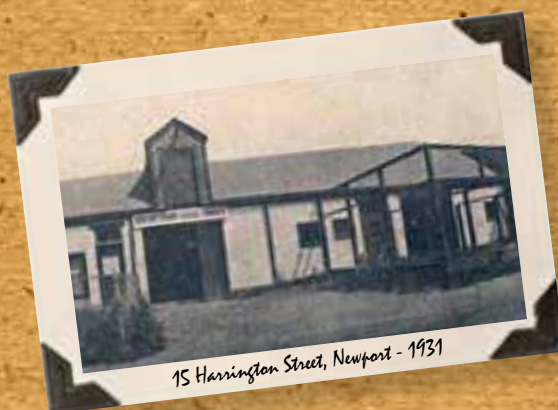
15 Harrington Street, Newport - 1931

Celebrating 85 Years of Enriching Lives and Making a Difference