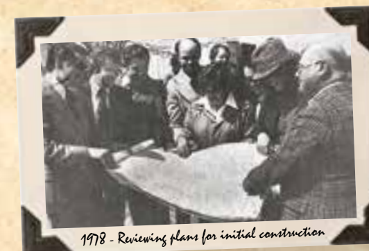
1978 - Reviewing plans for initial construction