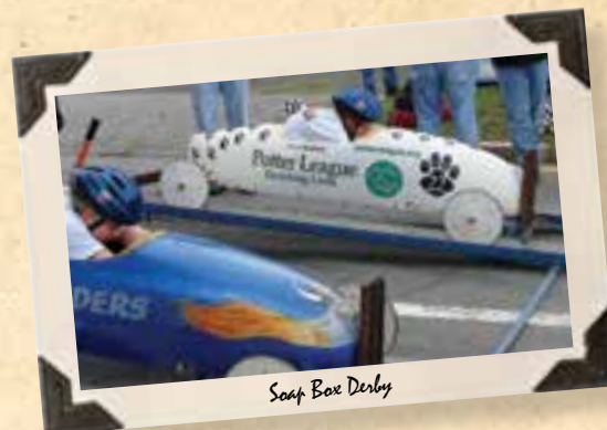
Soap Box Derby