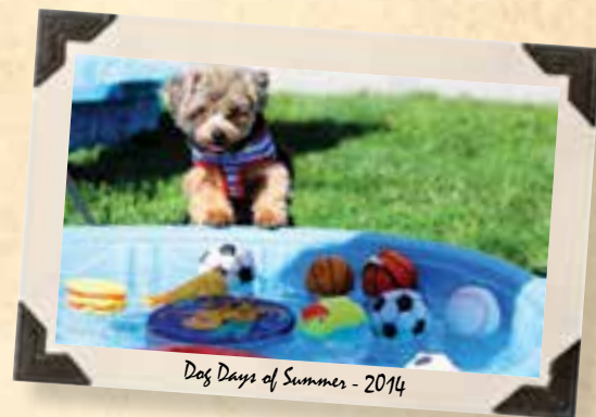
Dog Days of Summer - 2014