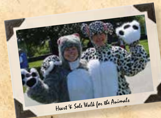
Heart & Sole Walk for the Animals