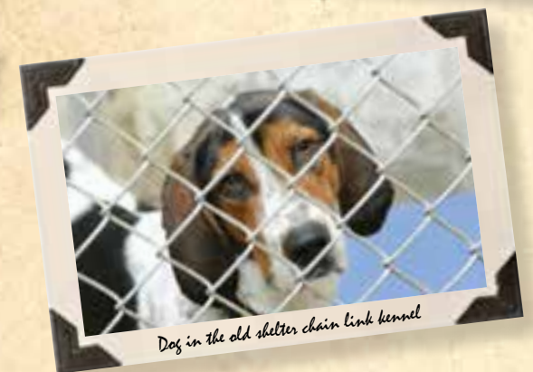
Dog in the old shelter chain link kennel