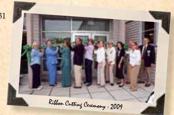
Ribbon Cutting Ceremony - 2009