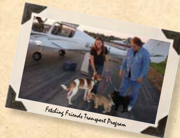
Fetching Friends Transport Program