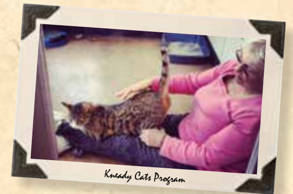
Kneady Cats Program