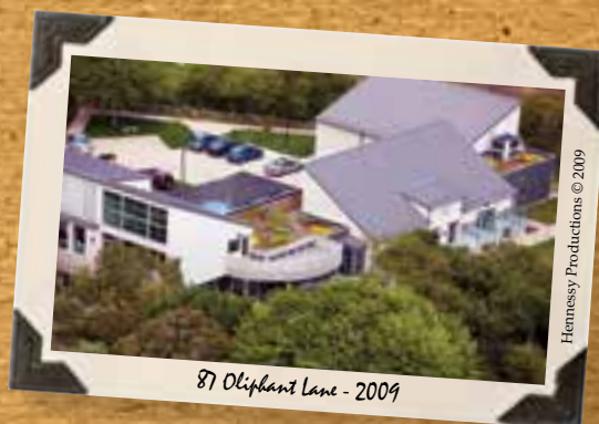
Hennessy Productions © 2009